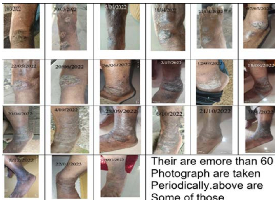
These are few photographs taken during follow up, more than 60 photographs we have in this case.

is “Left-sided complaints.” as the patient eczema was primarily left side Another important keynote of Graphities is “Ailments from suppressed eruptions”, and this is a common cause of eczema, Another significant Keynote of Graphities is “discharge are thick, sticky, offensive, foul, scanty and acrid”, This Keynote further confirms the selection of Graphities as its totality of symptoms was right. In this case, the patient showed significant improvement with Graphities 30. Homoeopathy also takes into account the mental and emotional aspects of a person while choosing a remedy. In this case after analyzing the patient's mental and emotional state, it was found that he was a reserved and introverted person who had difficulty expressing his emotions. This personality trait is also in line with Graphite Indication as it is known for its usefulness in treating emotional suppression and introverted personalities. Homoeopathy treated patients with individualized medicine and doses, depending on their unique symptoms and response to the remedy. In this case, Graphitis 30 is Medicine given in stages, and it shows signs of improving Eczema.