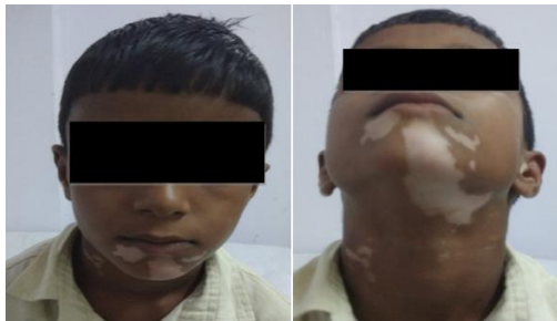
Before treatment (14/8/18)