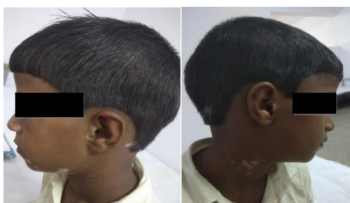
Before treatment (14/8/18)