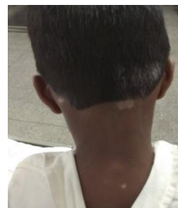
Before treatment (14/8/18)