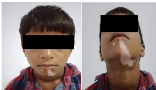
After treatment (10.9.19)