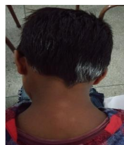
After treatment (10.9.19)