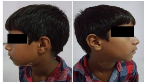
After treatment (10.9.19)