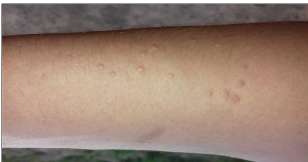
Fig 2: After image