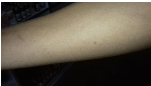
Fig 1: Before image