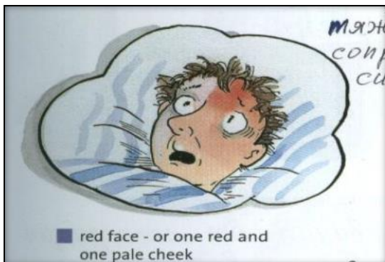
Fig 3: Feverish condition of Aconite

Patient Throat dry red, constricted. Burning and cutting pains in the intestines. Vomiting, fear, heat, and profuse sweat. Intense thirst for cold water is present ameliorated by iced drinks. Stools are of pure blood, grass green colored, or like chopped herbs, or white.