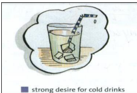
Fig 4: Aconite patient thirst during fever

Patient Throat dry red, constricted. Burning and cutting pains in the intestines. Vomiting, fear, heat, and profuse sweat. Intense thirst for cold water is present ameliorated by iced drinks. Stools are of pure blood, grass green colored, or like chopped herbs, or white.