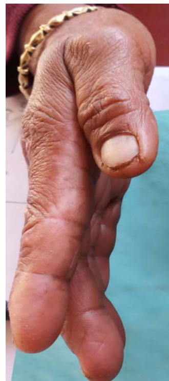
Fig 3: Image of the patient after treatment (28.12.16)