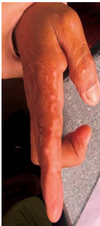
Fig 2: Image of the patient at baseline (08.08.16)