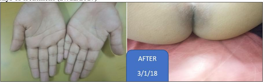
Fig 10: Warts on Bilateral Hands

Follow up after 21 days of treatment (27/12/2017)