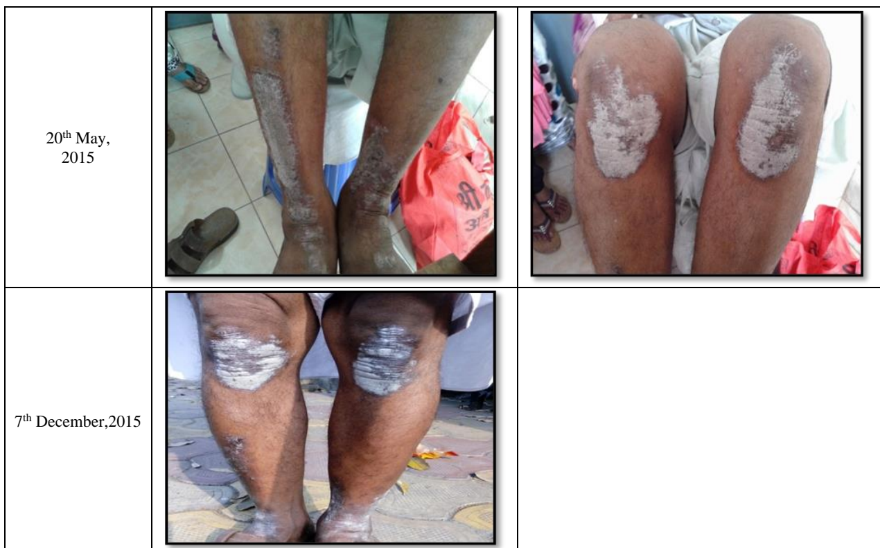
Table 3: Photographic presentation of the case

What has been taught by our master it has been proved once again, that is to say that we treat the patient and not the disease according to the name or diagnosis. If the totality matches there will be cure for sure. During the treatment patient has shown improvement. So this case may be considered as “improved one”. As psoriasis is an episodic disease and it can recur at any time of the years. So the follow-up the case is necessary timely.