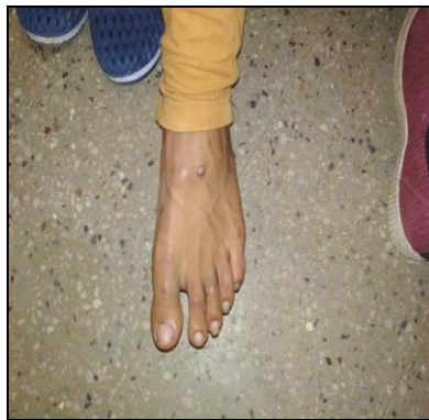
Fig 2: Before treatment