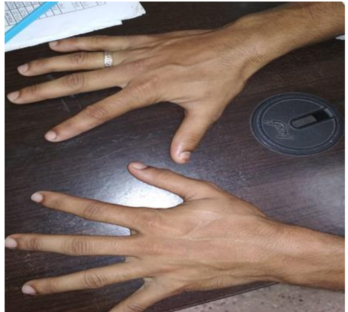
Fig 4: After treatment

[6] . Natrum mur not only removed the Verruca vulgaris, but also eradicated the tendency or disposition of its recurrence. Though most of the warts easily give in to homoeopathy still more intense research studies are warranted for evaluating the efficacy of several medicines in such condition as mentioned in our materia medicas and repertories.