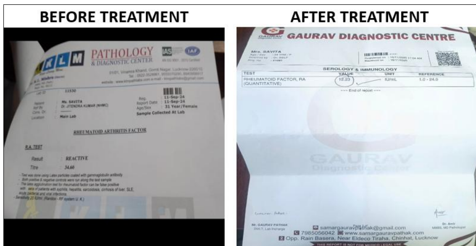
Fig 2: Comparison of case reports