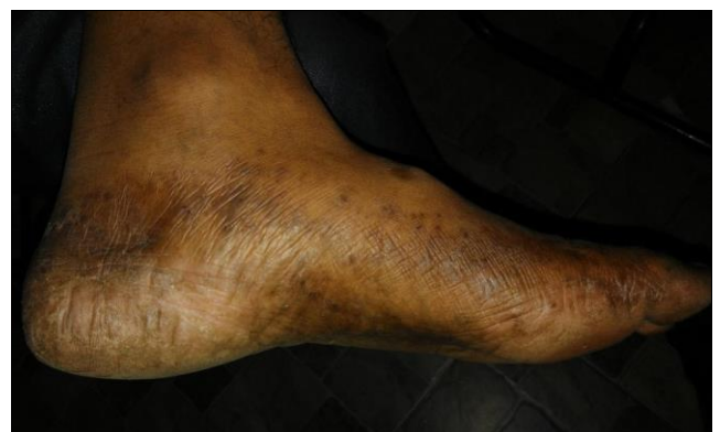
Fig 7: Before homoeopathic treatment plantar psoriasis