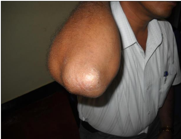
Fig 9: Before homoeopathic treatment flexural psoriasis