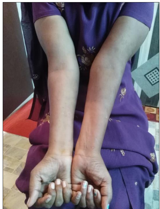
Fig 6: After homoeopathic treatment