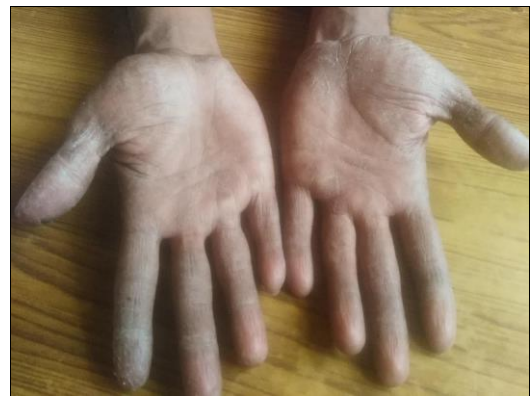
Fig 13: Before homoeopathic treatment palmar psoriasis