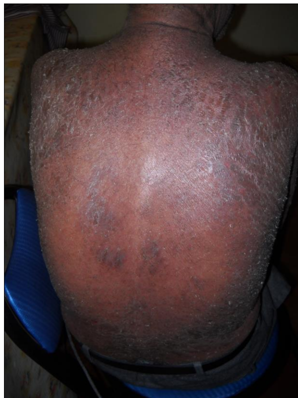
Fig 1: Before homoeopathic treatment, plaque psoriasis