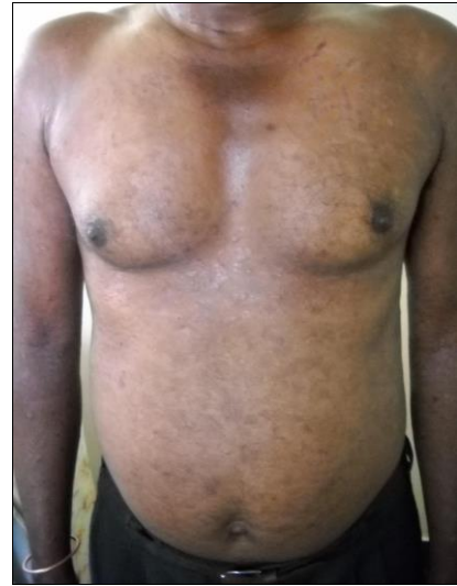
Fig 12: After homoeopathic treatment