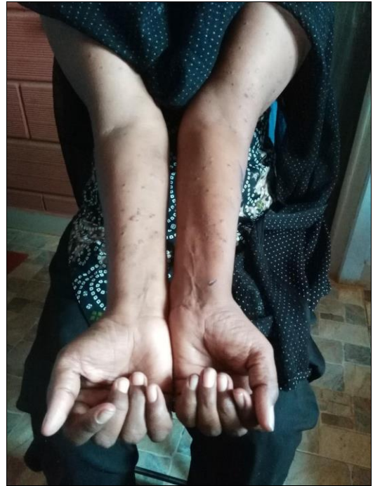
Fig 5: Before treatment, guttate psoriasis