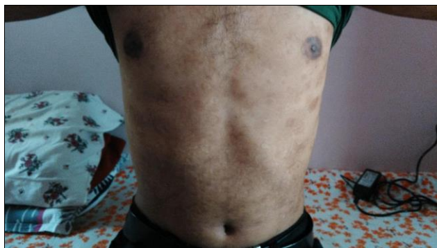
Fig 16: After homoeopathic treatment