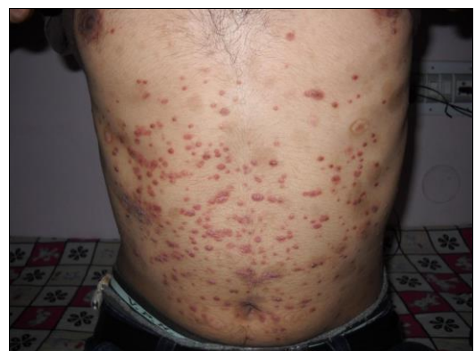
Fig 15: Before homoeopathic treatment guttate psoriasis