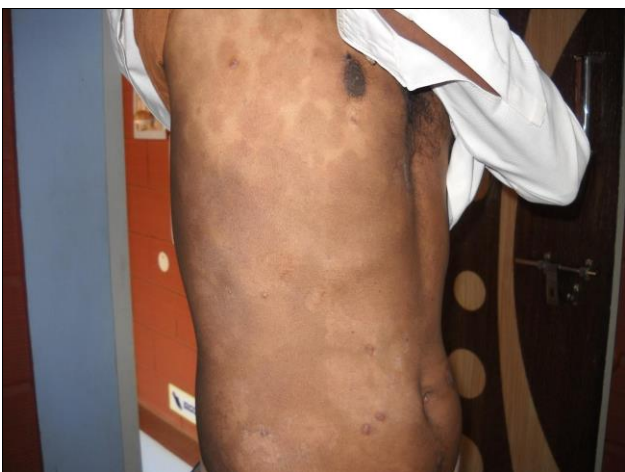
Fig 4: After homoeopathic treatment