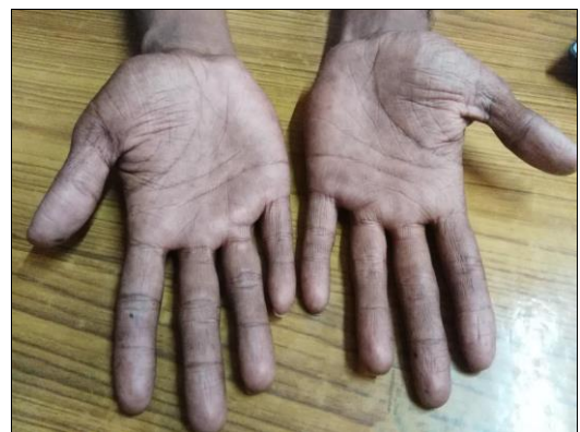
Fig 14: After homoeopathic treatment