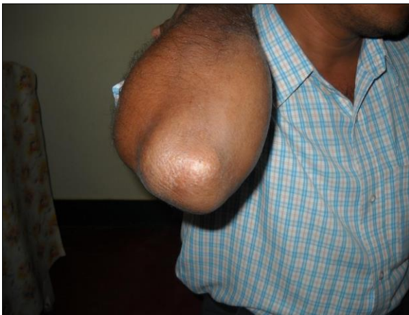
Fig 10: After homoeopathic treatment