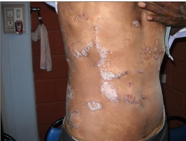
Fig 3: Before homoeopathic treatment plaque psoriasis