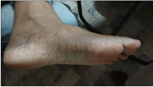
Fig 8: After homoeopathic treatment