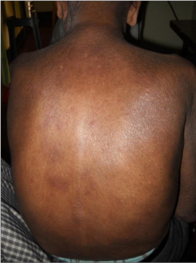
Fig 2: After homoeopathic treatment