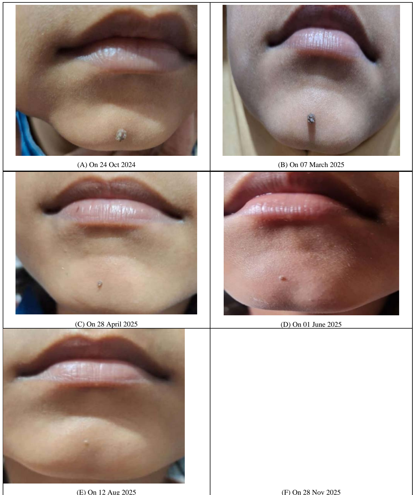
Fig 3: Images showing wart on chin during the treatment period.