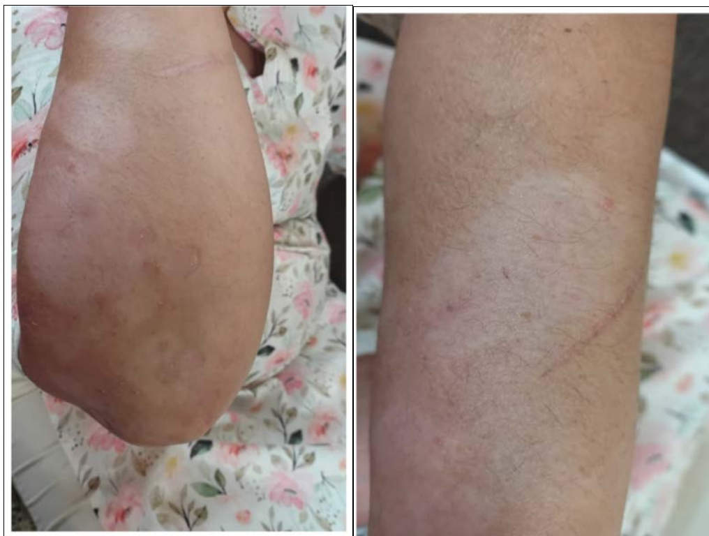
Fig 6: Results after final treatments 2/7/24