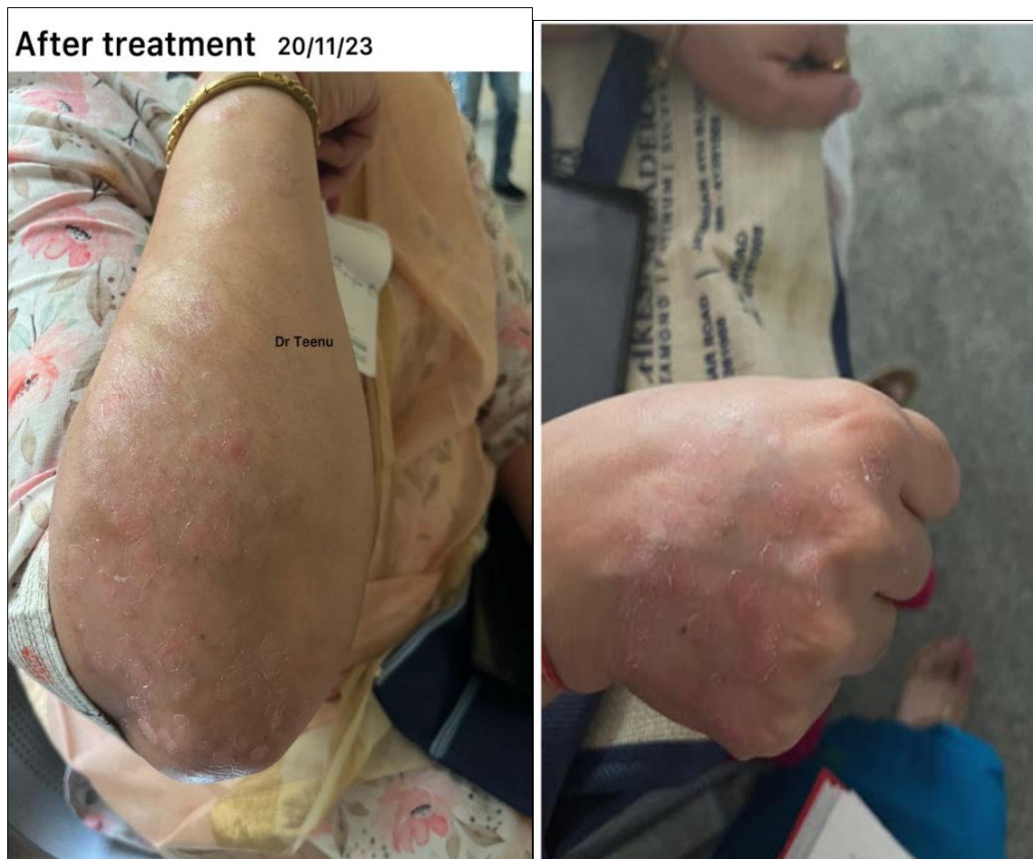
Fig 4: after treatment (20/11/23)