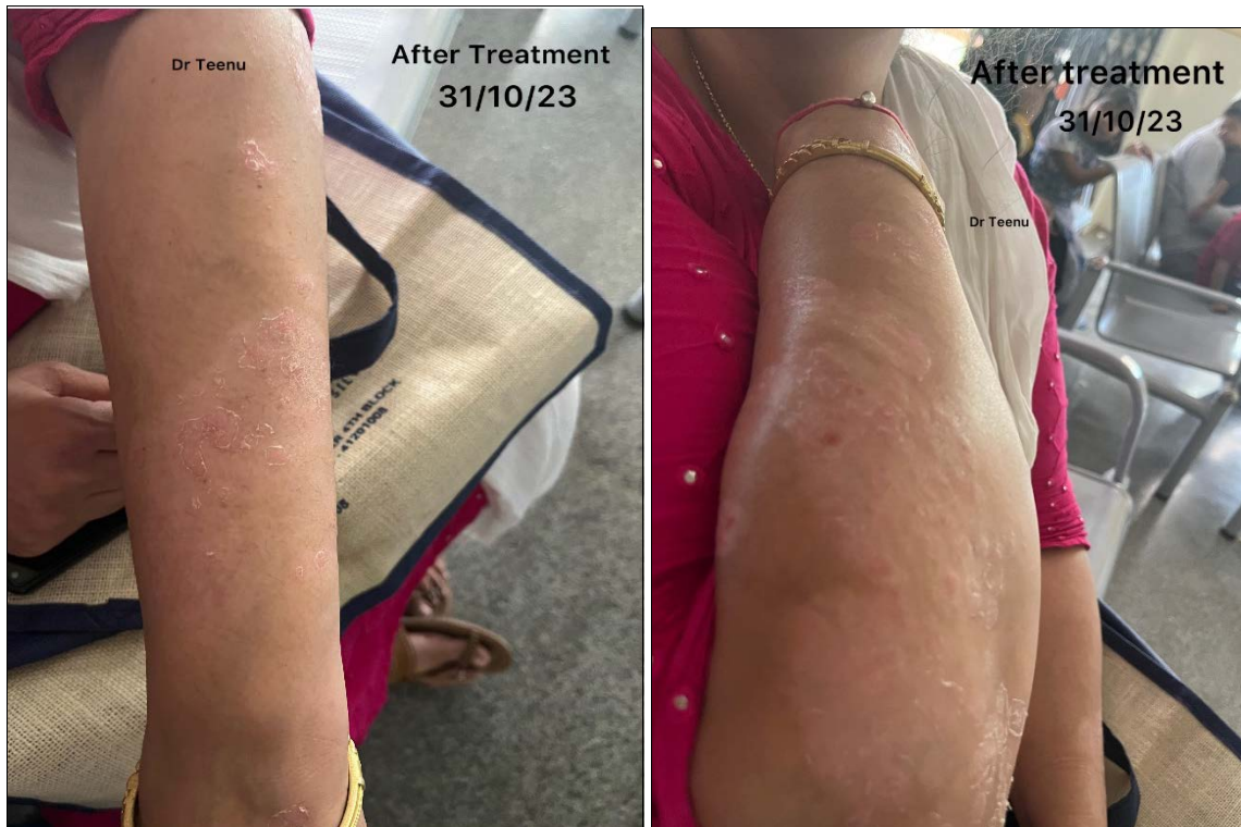
Fig 3: after treatment (31/10/23)