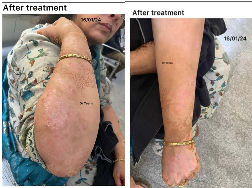
Fig 5: After treatment (16/01/24)