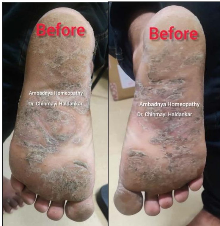
Fig 1: Left sole - before