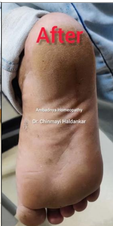
Fig 8: Right sole - after