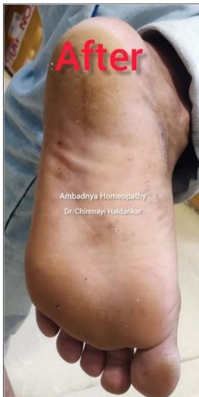
Fig 7: Left sole - after