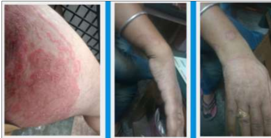
Fig 2: Before treatment