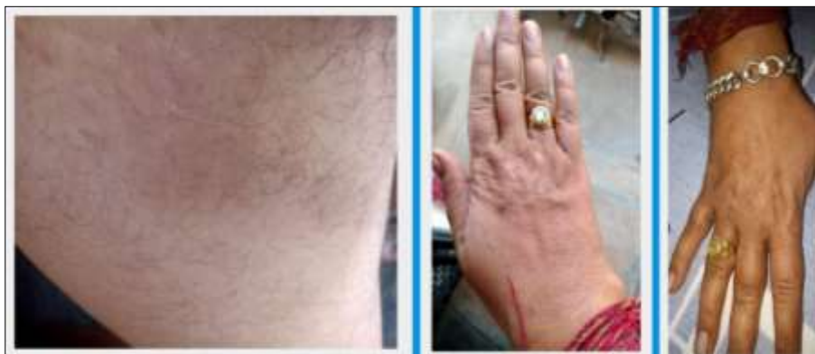
Fig 3: After treatment