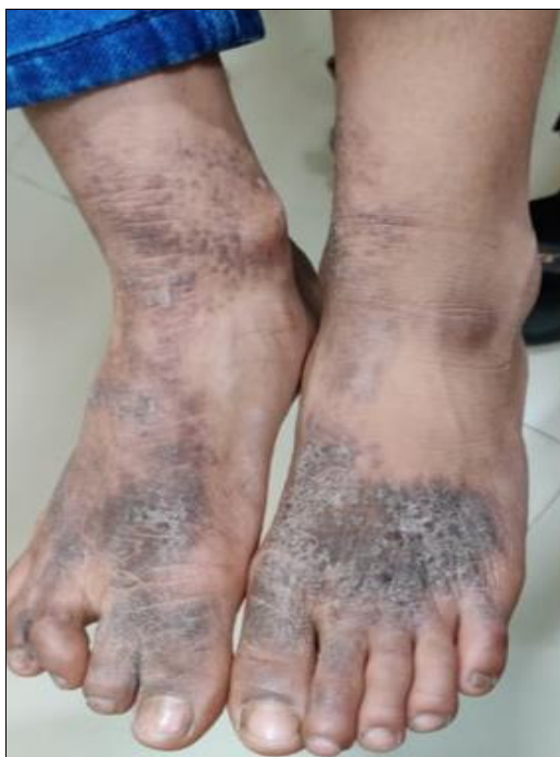
Fig 3: Before treatment