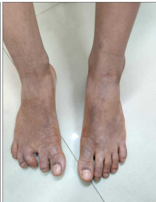
Fig 4: After treatment