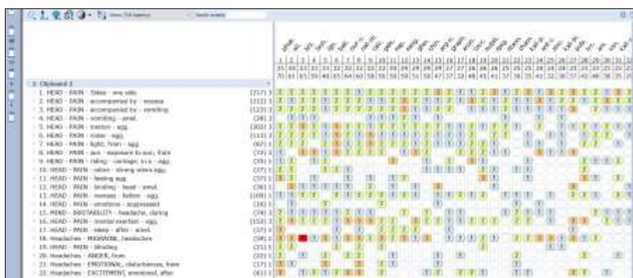
Fig 1: Shows basing on all the common symptoms of Migraine (Including causation, aggravation, amelioration)

1. Basing on all the common symptoms of Migraine (Including causation, aggravation, amelioration): A total of 23 Rubrics were considered by critically extracting the rubrics at the possible extent. The Repertorial result was found to be Phos, Silicea, Bryonia, Lachesis, Ignatia, Bell, Nat.mur, Nux vom, Gels, Calc.