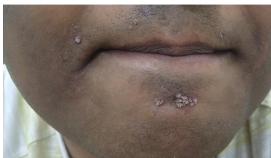
Fig 2: 2/10/2019 Before treatment