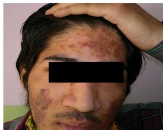
Fig 2: Before treatment