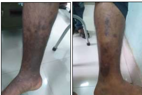
Fig 3: (On 4 TH Visit)