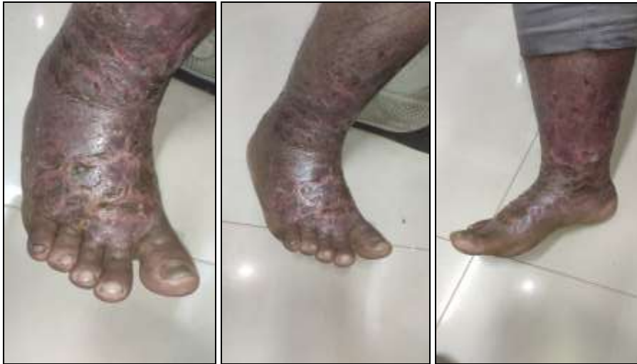
Fig 1: Initial Presentation