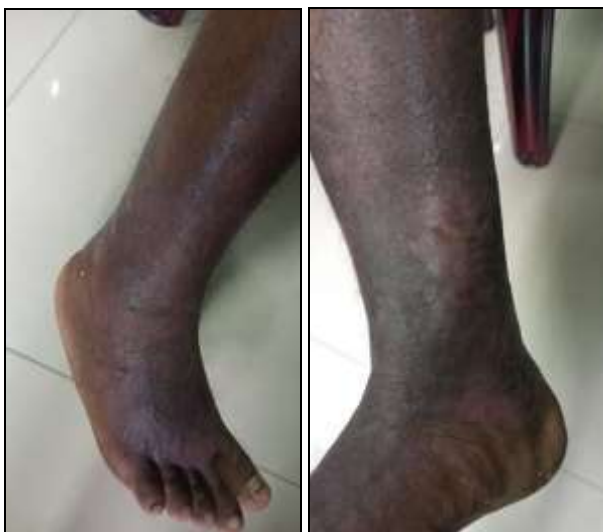
Fig 2: During treatment