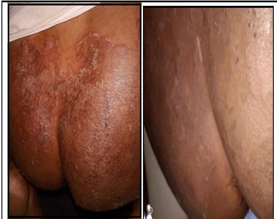
Fig 2: Before & After Pictures