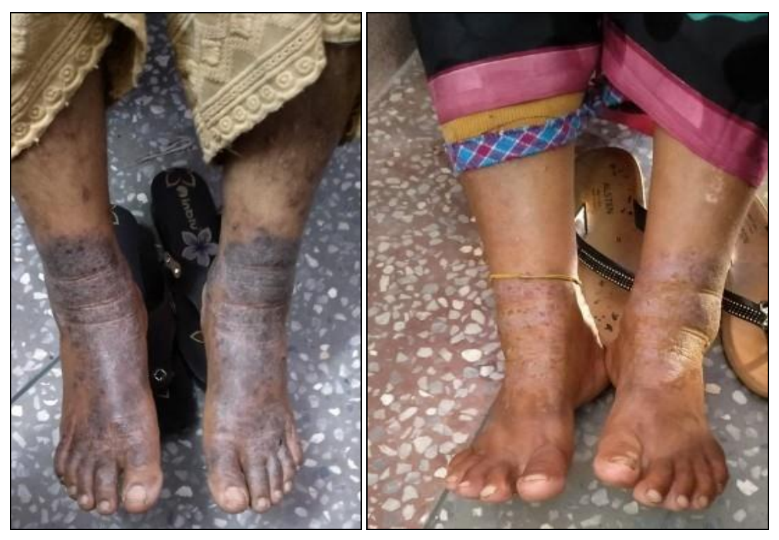
Fig 2: Before Treatment

Dose: Third to thirtieth potency. Locally, the tincture, but should never be applied hot or at all when abrasions or cuts are present.