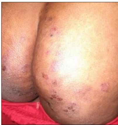
Fig 2: Before treatment