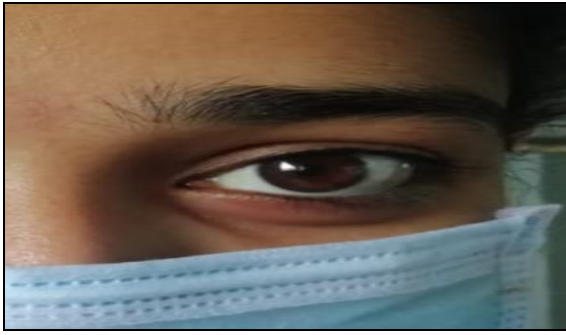
Fig 4: on 9-1-2022