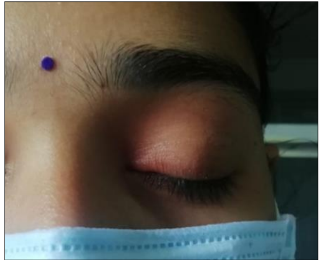
Fig 2: 2 nd January 2022