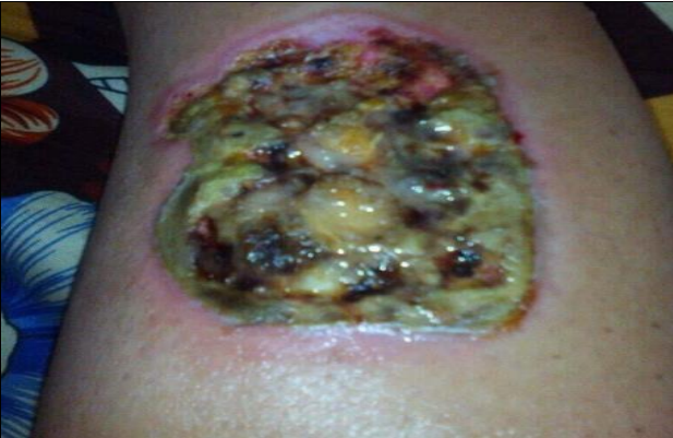
Fig 2: 30 th December, 2019