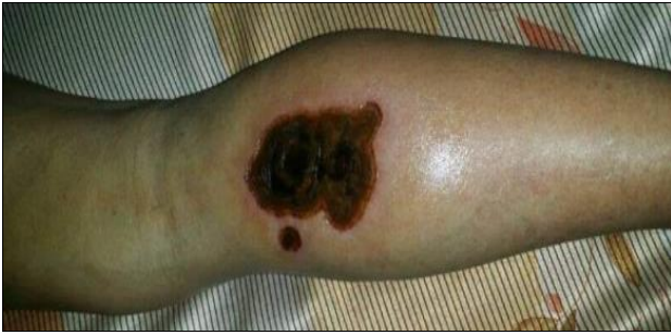
Fig 1: 12 th December, 2019