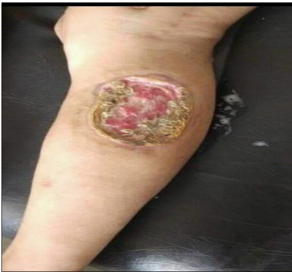
Fig 3: 28 th February, 2020