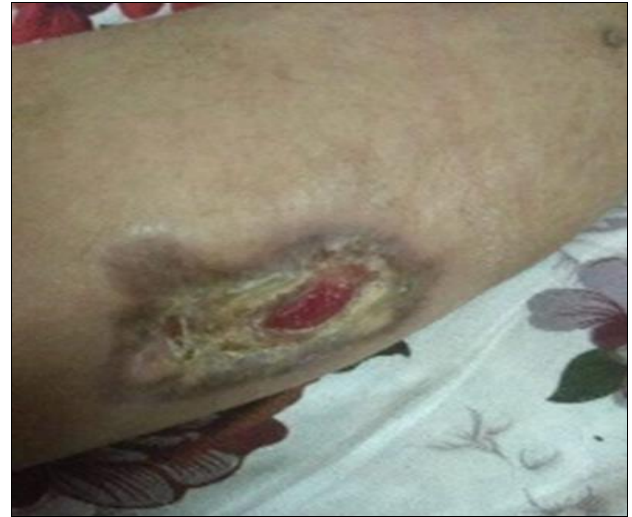
Fig 5: 28 th Aug, 2020