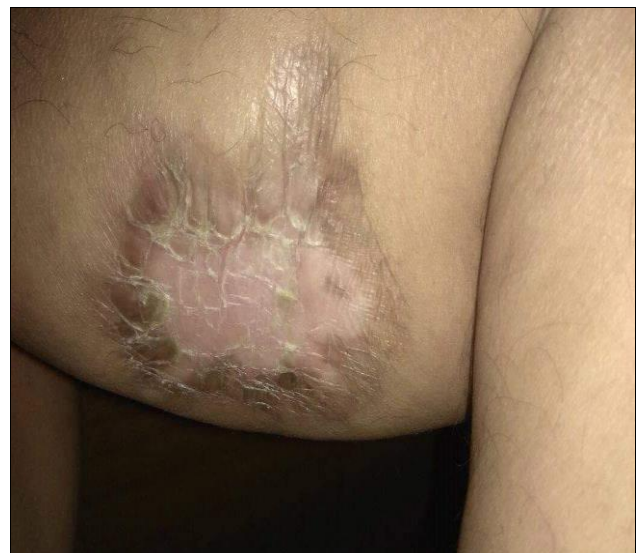
Fig 6: 27 th September, 2020