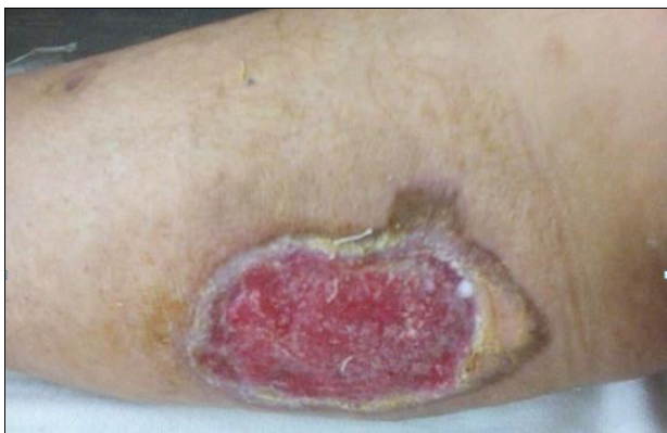
Fig 4: 27 th June, 2020