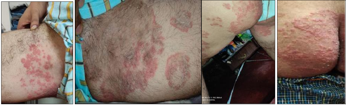
Fig 1: Before treatment