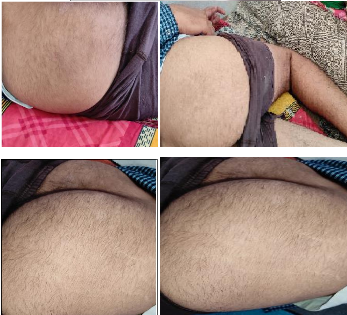
Fig 2: After treatment