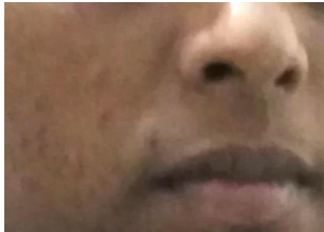
Fig 1: 3 rd November 2021