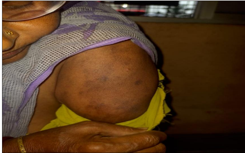
Fig 3: After Homoeopathic Treatment