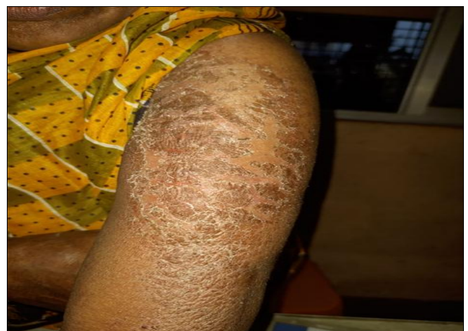
Fig 1: Before Homoeopathic Treatment

Clinical diagnosis: Atopic Dermatitis (Hanifin and Rajka-developed criteria for diagnosis in 1980)