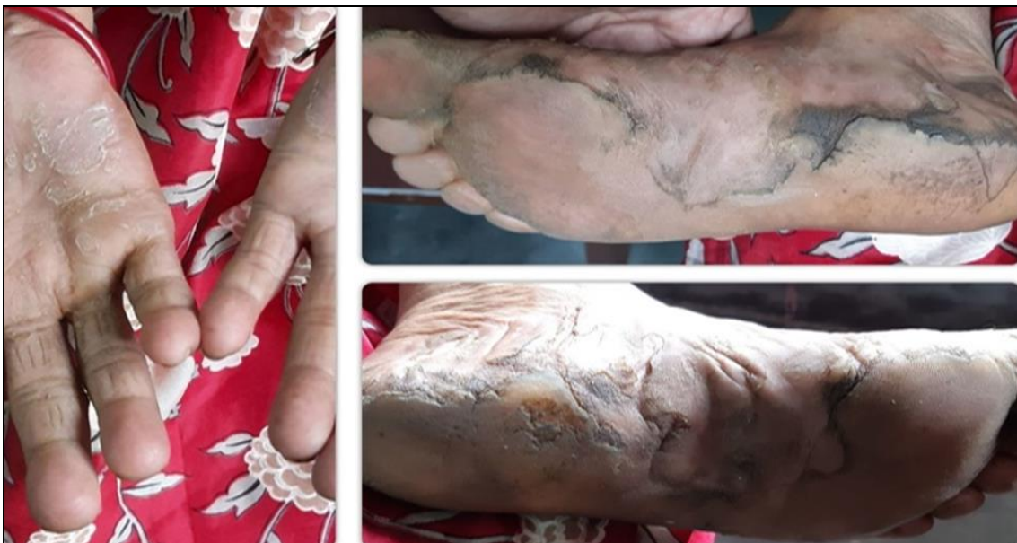
Fig 1: Before Homoeopathic Treatment

Clinical diagnosis: Atopic Dermatitis (Hanifin and Rajka-developed criteria for diagnosis in 1980) [18, 19, 20].