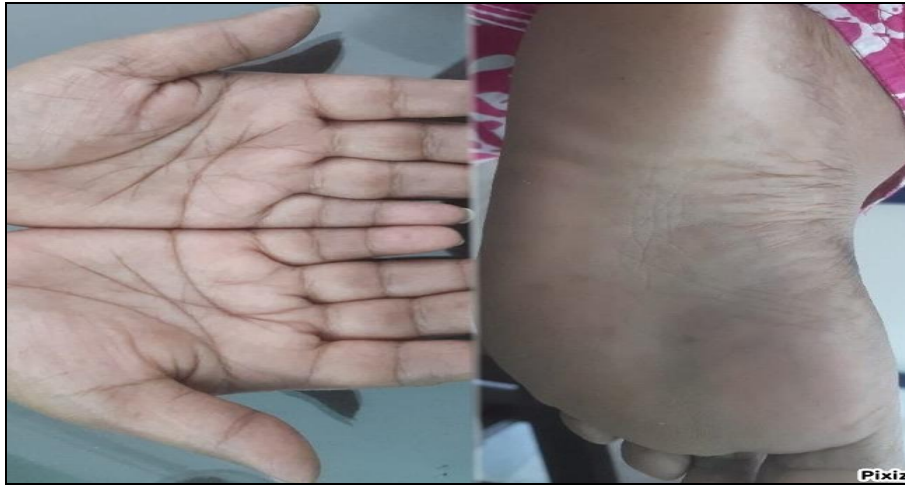
Fig 3: After Homoeopathic Treatment