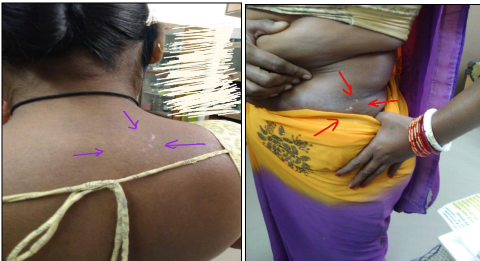
12 Months after treatment