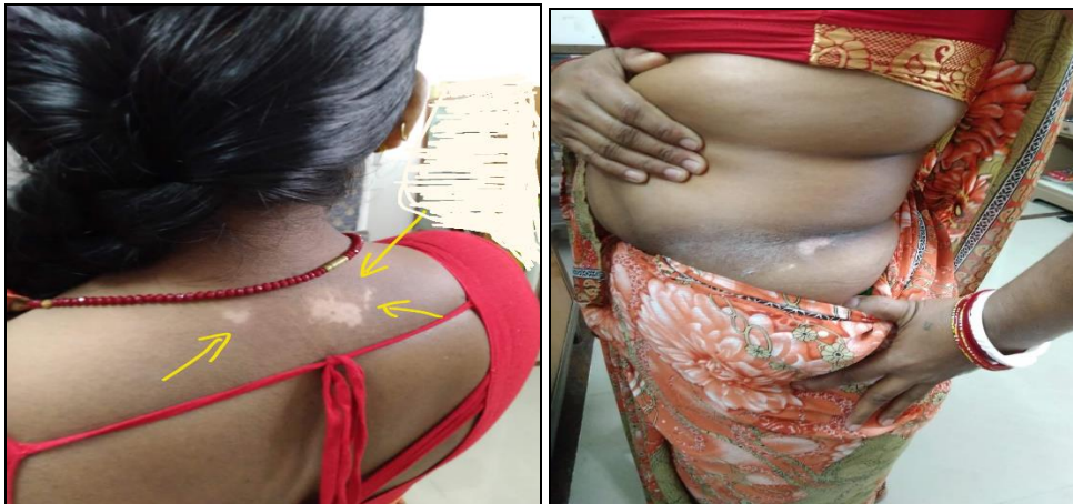
6 Months after treatment