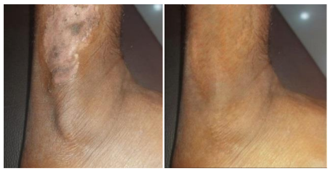
Fig 2b: Under treatment