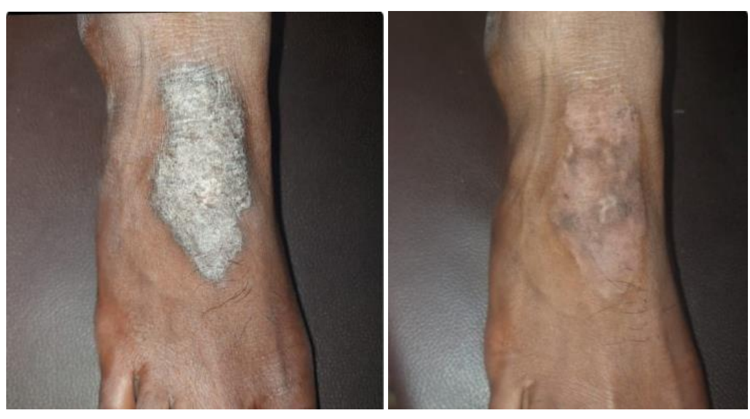
Fig 1a: Pretreatment