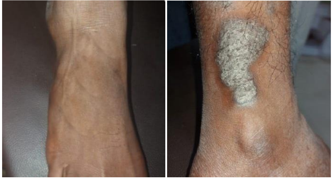
Fig 1c: Post treatment