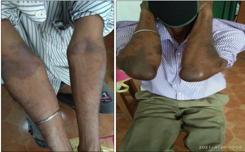
Fig 2B: Second visit