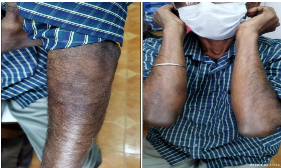
Fig 2C: Before final visit (10 th visit)