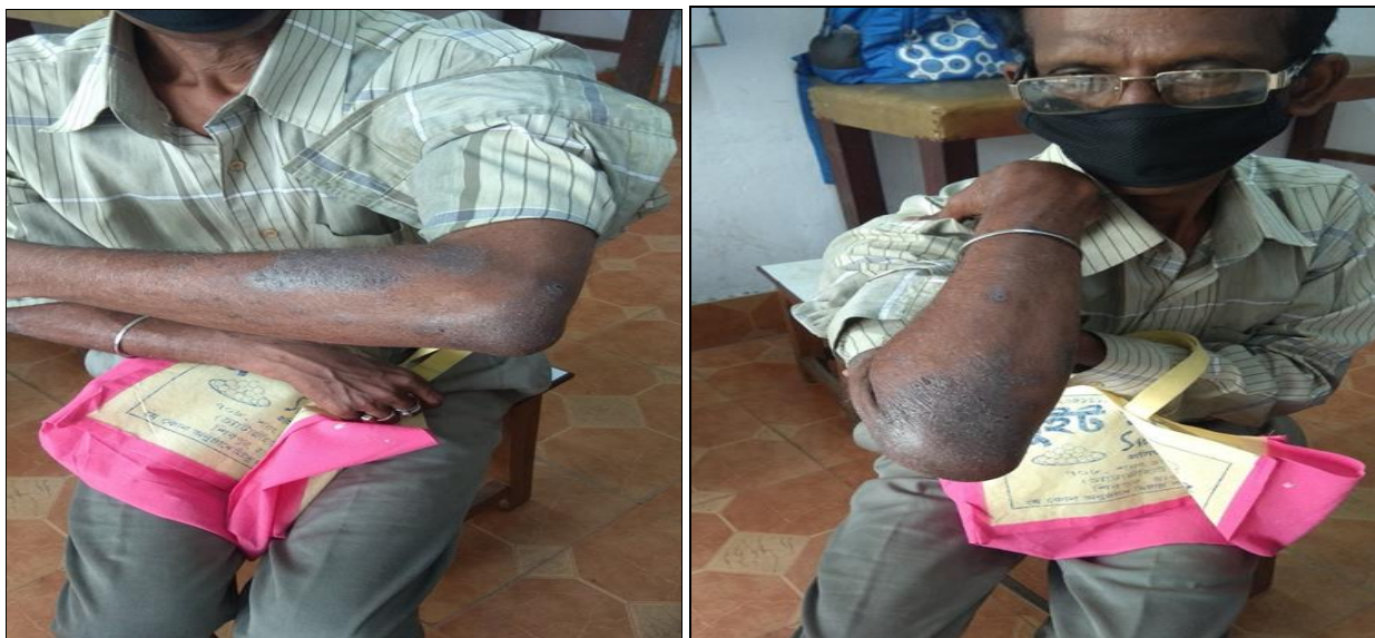
Fig 2A: First visit