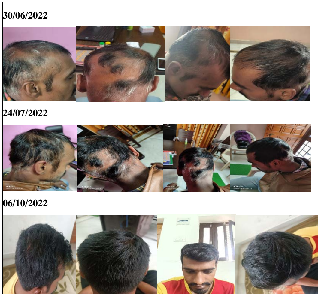
Fig 3: Discussion