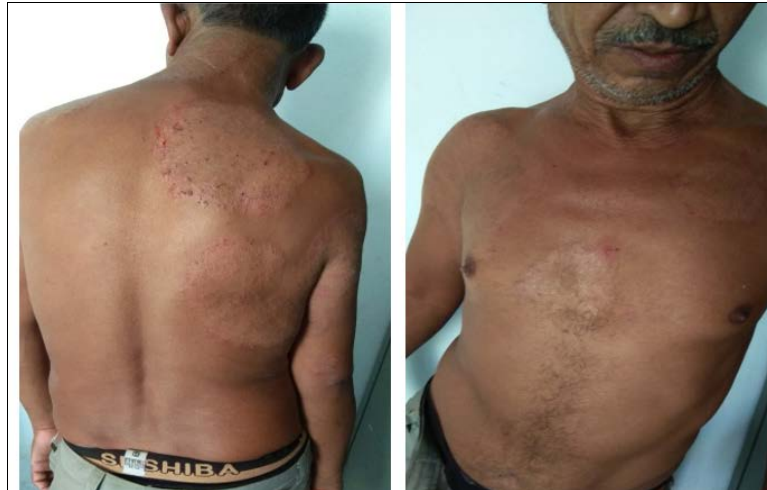
Fig 2: Pre-treatment