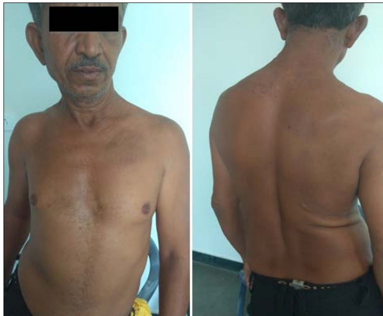
Fig 3: Post-treatment